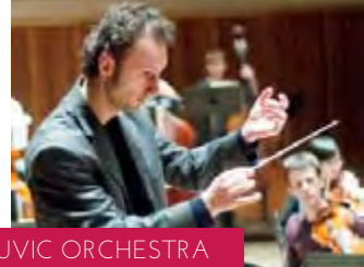
UVIC ORCHESTRA OCT 31 & NOV 29

Featuring School of Music students, with appearances from faculty, sessionals, alumni, guest artists, and community members, our ensemble concerts offer some of the most robust and exciting programs of the semester. Venues and admission fees vary and are listed below.