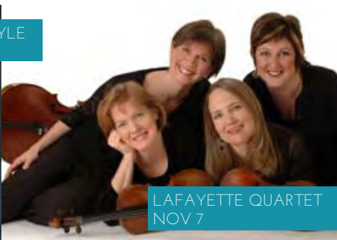
LAFAYETTE QUARTET NOV 7